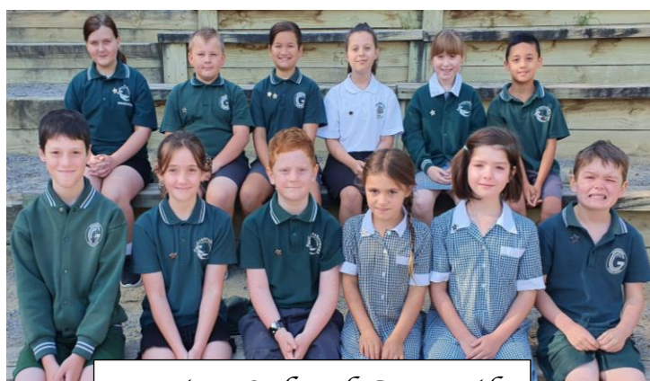
Junior School Council