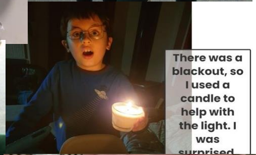
There was a blackout, so I used a candle to help with the light. I was surprised