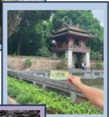
Hanoi – Vietnam