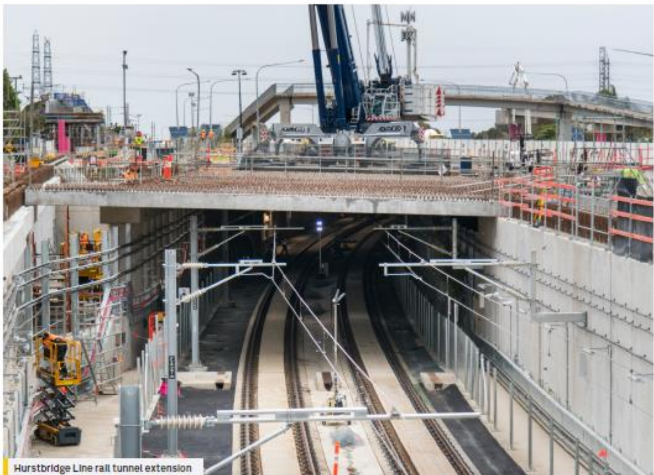
Hurstbridge Line rail tunnel extension

C ooperation A chievement R espect E mpathy