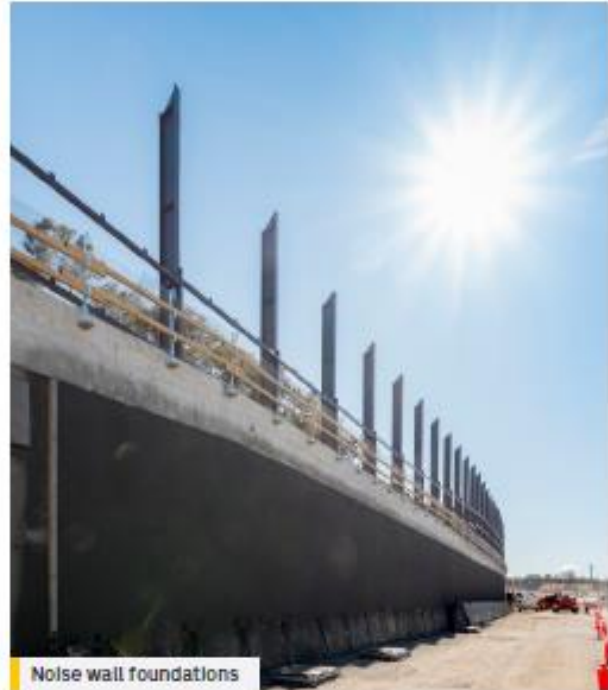
Noise wall foundations

For the latest updates on what's happening at Grimshaw Street, visit bigbuild.vic.gov.au/roads/grimshaw or scan the QR code.