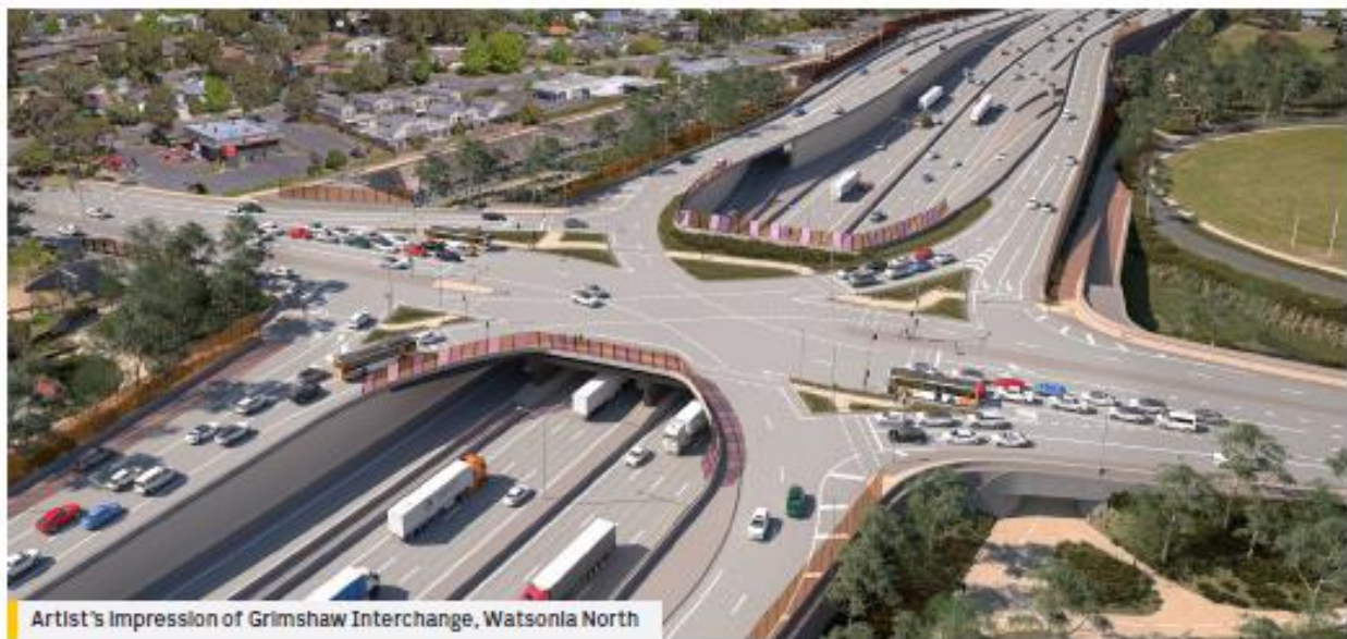
Artist's Impression of Grimshaw Interchange, Watsonia North