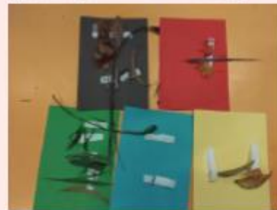
^ Our World Environment Day!

Mon-Fri [insert hours] [insert phone number] [insert email address]